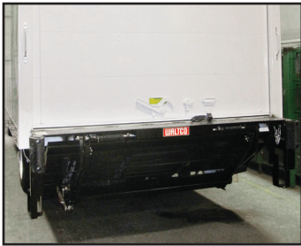
EM Series Gate in stowed position.