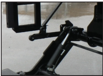
Bolt-on Parting Bar shown above.