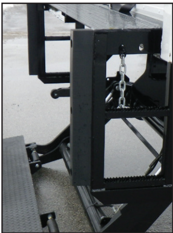
Optional Steel Dock Bumper with Built-in Traction Step and Full Coverage Rubber Pad