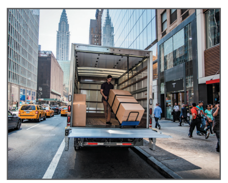
EM series gate in platform loading position. This liftgate is ideal for quick deliveries in tight spaces.

Platform auto adjusts as it lowers from bed level to ground level