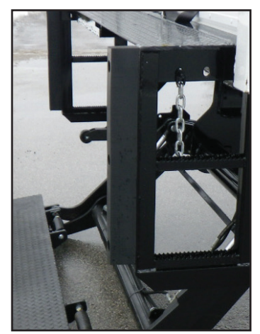
Optional Steel Dock Bumper with Built-in Traction Step and Full Coverage Rubber Pad