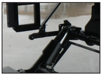
Bolt-on Parting Bar shown above.